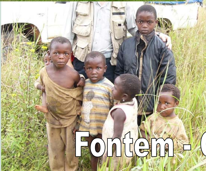
Fontem - Cameroun